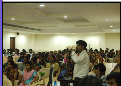
A view of audience in the seminar