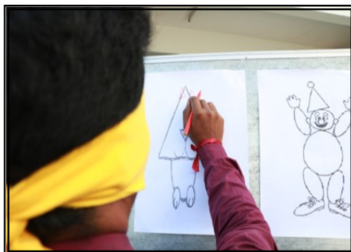
Active participation of staff in the event Figure drawing team .