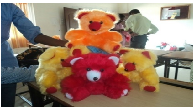
Beautiful toys made by students

The Department of Fashion Technology conducted a two day workshop on "Toy Making" for third year Ft students on 13<sup>th</sup> and 14<sup>th</sup> of August 2015. Mrs.K.Jayanthi, Trainer of Premier Fashions, Coimbatore was the resource person. Totally 41 students participated in the workshop. On the first day students were taught to make Teddy bears. They were provided with all the raw materials including fur, cotton, needle, thread, sponges, eyes and noses. They were taught to make each part in a manual method. On the second day, students attached all the component parts like nose and eyes together. When they completed they feel very excited. The trainer also gave patterns for making a dog. The workshop kindled students' interest in doing craft. It gave them a confidence to make and sell toys of various varieties in future.