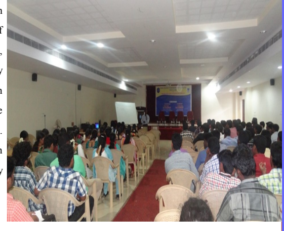
The chief guest inculcates in students the need for good communication skills

He gave practical scenario about the present job opportunities in the Supporting Enterprises and the need to become an entrepreneur. He loss in approaching the concerned authorities in starting SSI and MSME. The students by giving "Opportunities Available for the Young neers in Sarting New ventures". He highlighted the "Different Schemes offered