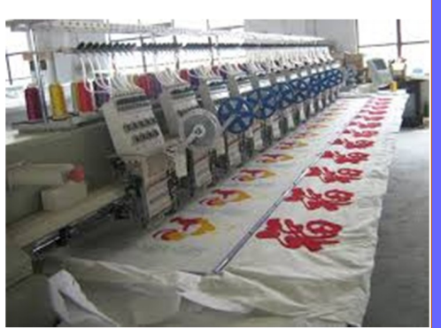
Multi Head Embroidery Machine